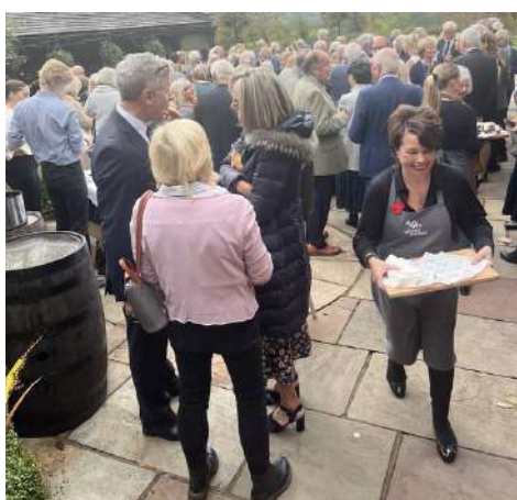
Guests enjoying the canapé reception and the event.